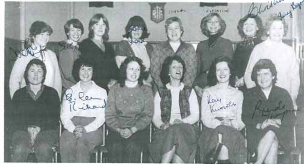
LADIES OF THE CHORUS