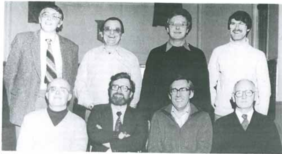
GENTLEMEN OF THE CHORUS